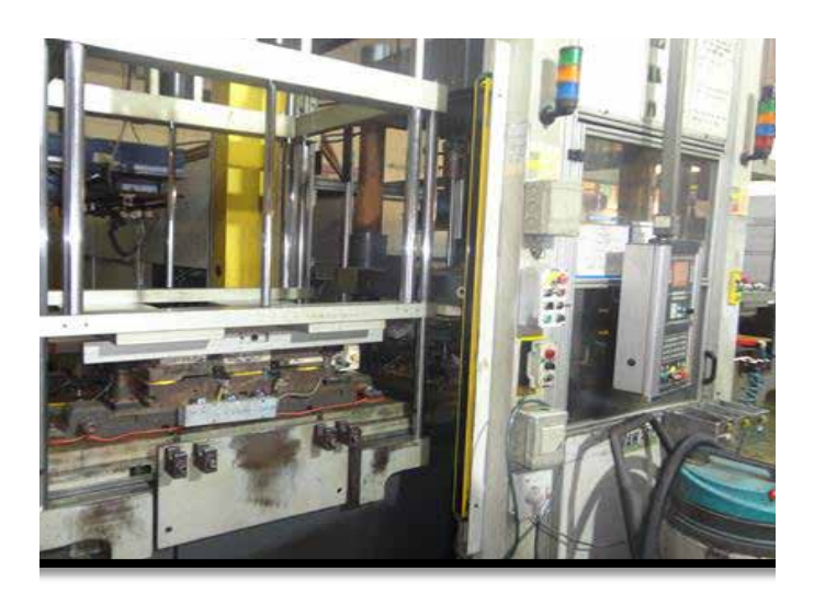
Encapsulation for Quarter Window