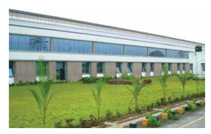
World-class Manufacturing Units of AIS