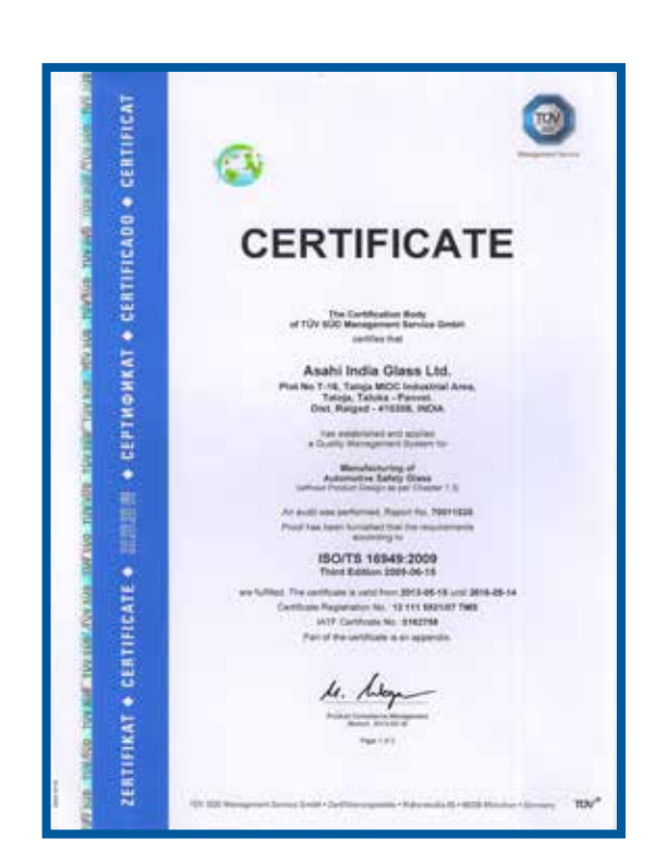
Quality Management System for Manufacturing of Automotive Safety Glass