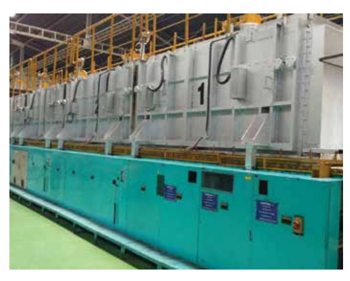
Tempering Furnace for Sidelites