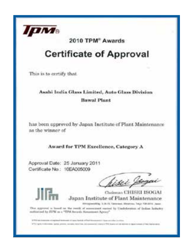
Award for TPM Excellence – Category A