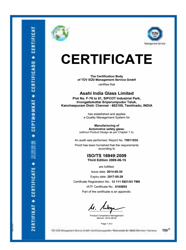
Quality Management System for Manufacturing of Automotive Safety Glass