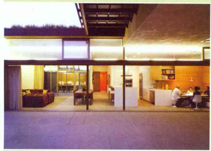
Yin-Yang House: Sustainable single family residence, Architects: Brooks + Scarpa (formerly Pugh + Scarpa)