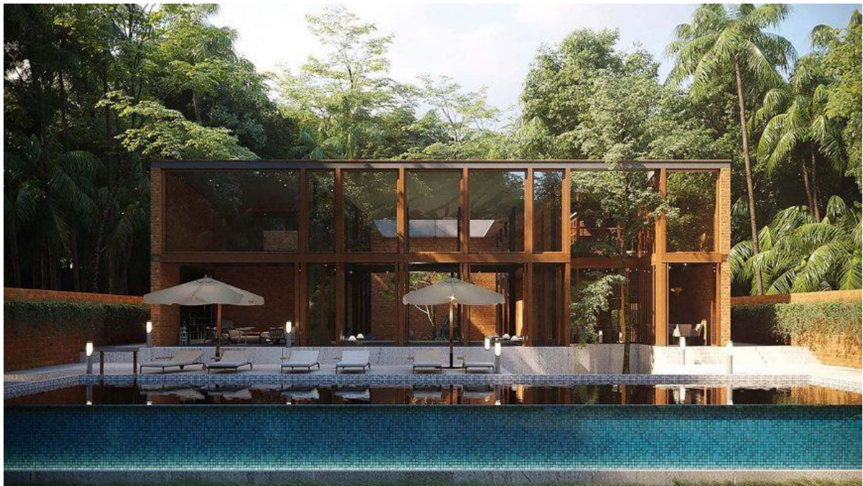
Inside the AIS Glass Villa in Goa designed by Tarun Tahiliani