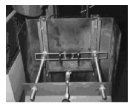
Fig 4 Charring during test

The tests are summarised in table 1: The results suggest that the commercially available product tested does not perform well under these testing conditions. Both the pyroguard and the laboratory made glass showed charring of the interlayer after several seconds, as is shown in figure 4.