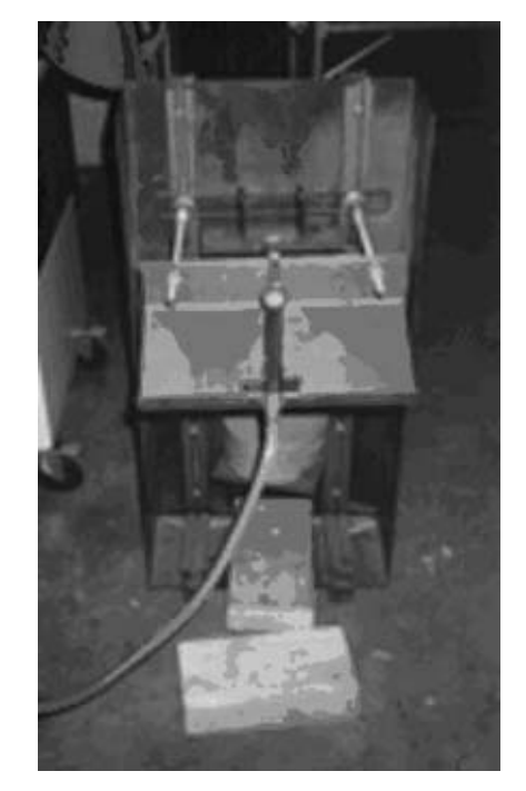
Fig 2 Testing method for beams

edges. A beam specimen that is under a static four point bending load is exposed on one side to a burner providing a constant heat flow. When the last glass layer fails the specimen break. The provision of a pre-stress gives a more constant failure point. The method is illustrated in figure 2.