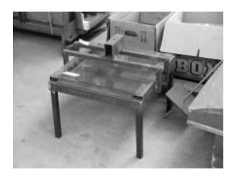
Fig 3 test rig for testing plates

of glass in the sample. Commercially available pyroguard was compared with a laboratory made alternative of 3 mm glass bonded with a cheap, clear, epoxy resin. The pyroguard and the glass for the laboratory made specimens had comparable glass edges to ensure a fair comparison. During the test the temperature is measured with a thermocouple on the back face of the specimen and recorded.