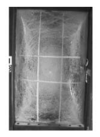
Fig 3 Post test photograph of ionoplast laminate.

A significant feature of ionoplast interlayers is that they can be molecularly engineered to adhere well to various metals as well as glass. This allows integration of metal components in the laminate either during autoclaving or in post-autoclaving attachment process. Our results presented in the previous section showed that we did not attain the tear resistance of the laminate but ultimate performance was limited by laminate pullout. The final test result plotted on Figure 2 (upper right-hand corner) is that of a laminate with an enhanced fixing method. The glazing was tested in an arena blast test in collaboration with the US Department of State. During laminate manufacture a channel section of aluminum was attached to the laminate. This was done in such a way as to assure contact between interlayer and metal and allow a strong adhesive bond to develop. The laminate tested consisted of a significantly increased interlayer thickness: 5 mm glass / 6.4 mm interlayer / 5 mm glass. The panel size was 1.83 m x 1.22 m, significantly larger than the panel size specified in Figure 2.