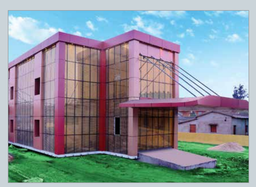
Project Name: Hotel Golden Steel