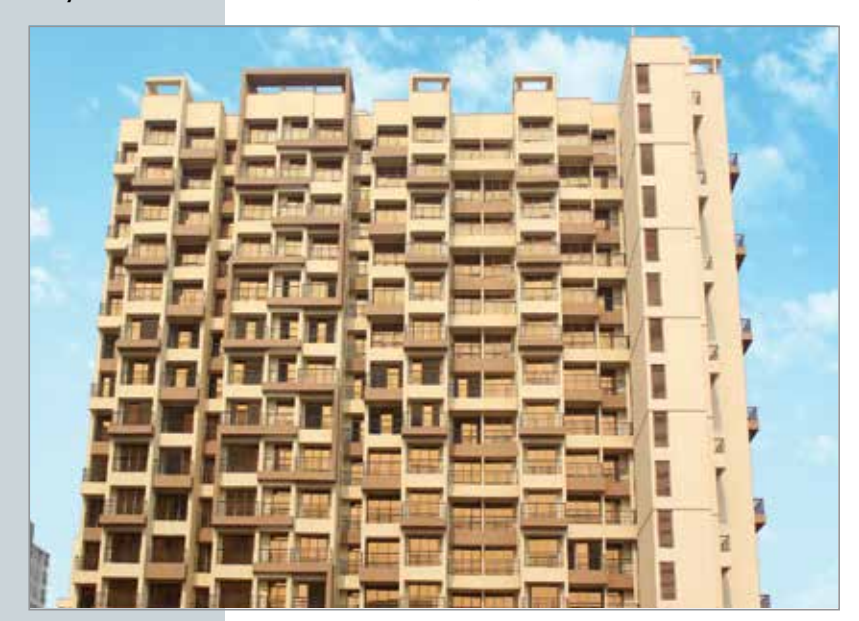
Project Name: Ashtavinayak Heights

Façade: SunShield Radiant Amber, 5 mm thickness