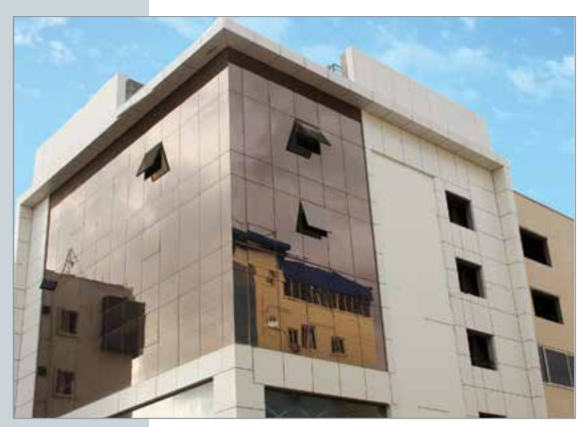
Project Name: Damodhar Commercial Project