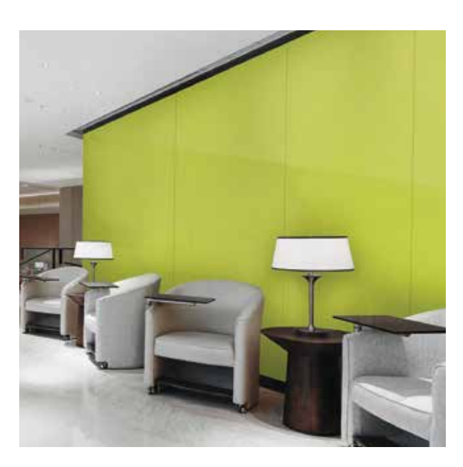
Colours Available: Available in 34 shades