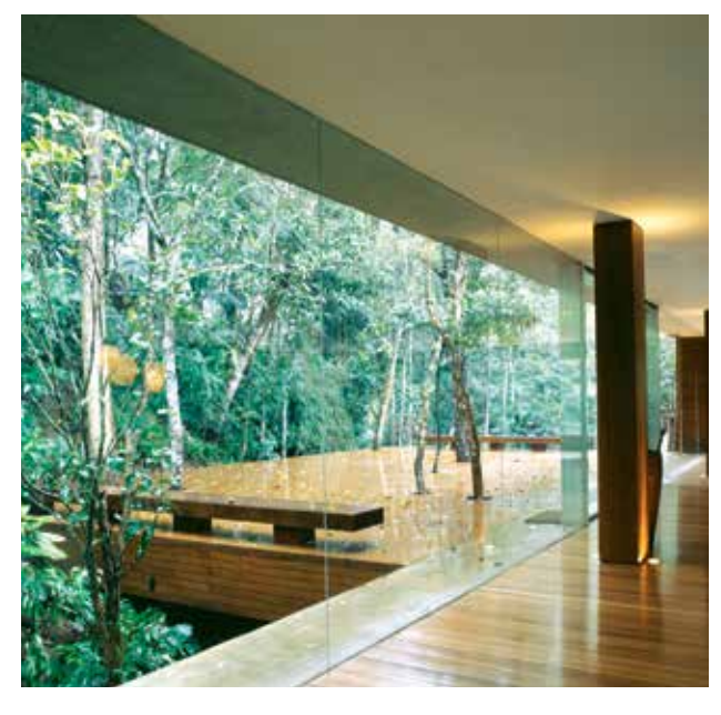
Thickness (mm): 2, 3, 4, 5, 6, 8, 10, 12