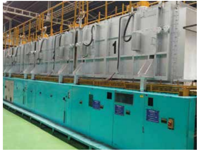
Tempering Furnace for Sidelites