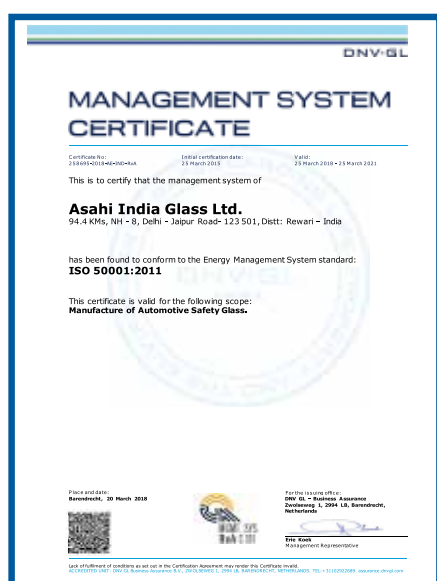
Quality Management System for Manufacture of Automotive Safety Glass