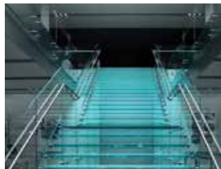
AIS Processed Glass