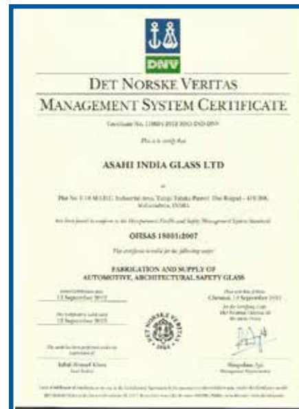
Fabrication and Supply of Automotive and Architectural Safety Glass