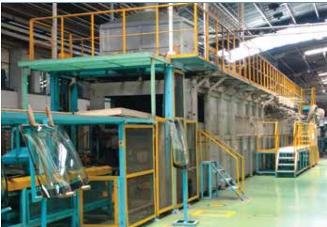
Laminated Bending Furnance