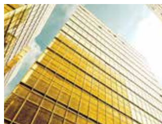
AIS SunShield Royal Gold