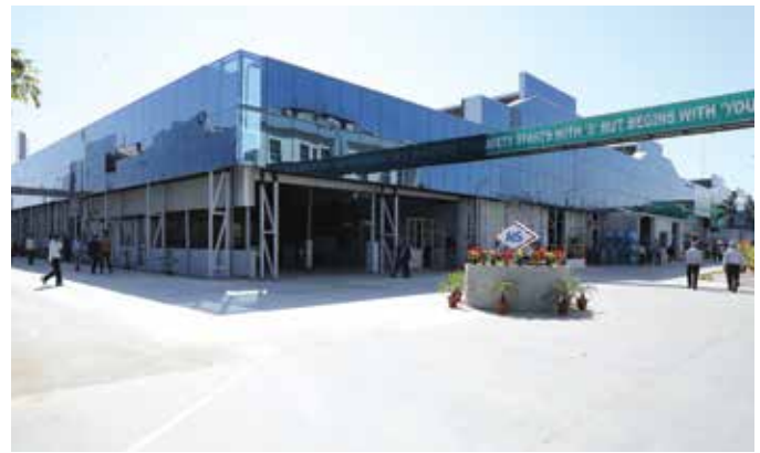
World-class Manufacturing Units of AIS