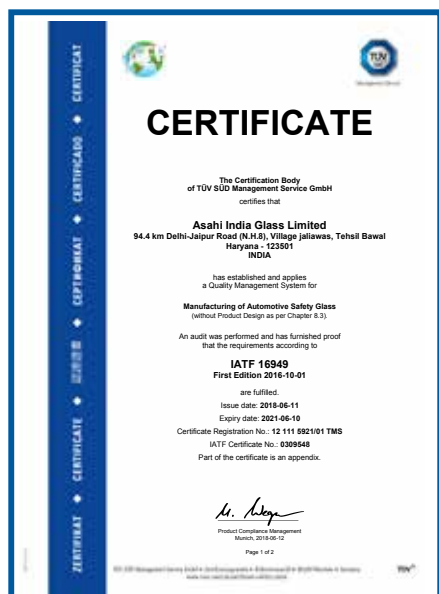
Quality Management System for Manufacture of Automotive Safety Glass