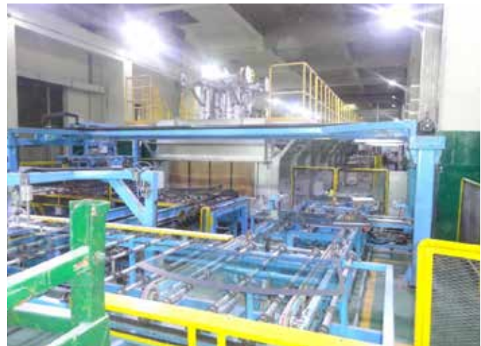
Bending Furnace for Car Glass