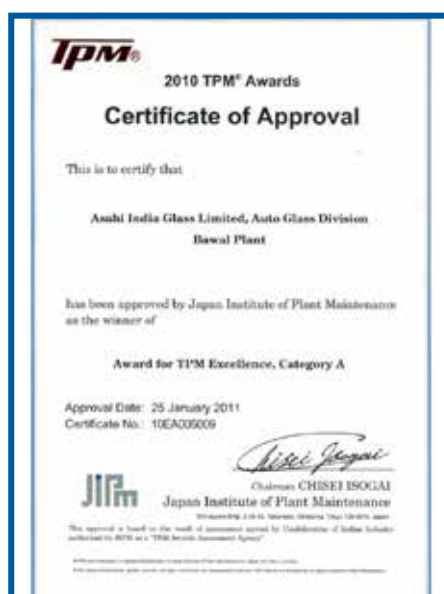
Award for TPM Excellence – Category A