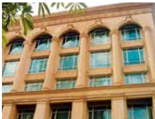
AIS Clear & Tinted

With possibly the country's largest offering in glass – across products, services, and solutions – AIS adds a new dimension to modern architecture and contemporary living spaces. With products that provide the right blend of daylight and energy-saving, visual comfort and thermal control, technology and eco-sensitivity, AIS is set to bring new ideas to life – enabling an age of green buildings and the dawn of a truly sustainable future.