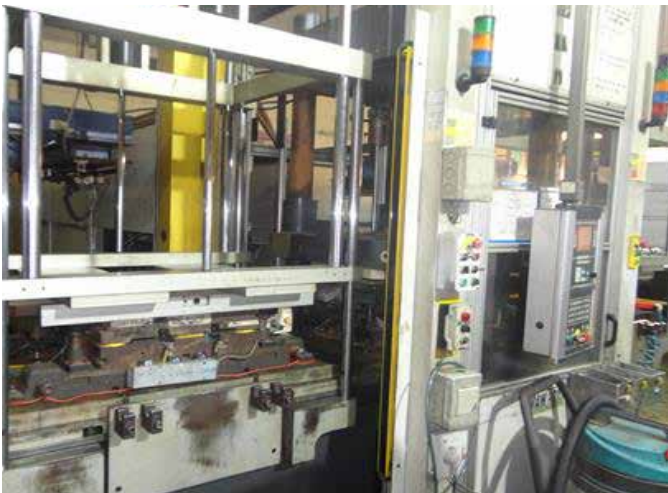
Encapsulation for Quarter Window