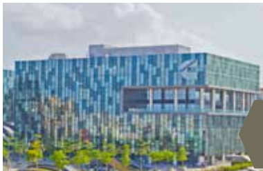
Cummins, Pune Ecosense Enhance - Spring, Snow, Aura