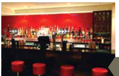
Kingfisher Club, Bangalore AIS Décor – Venetian Red