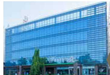
Kakade Bizcon Mall, Pune Ecosense Enhance - Marine