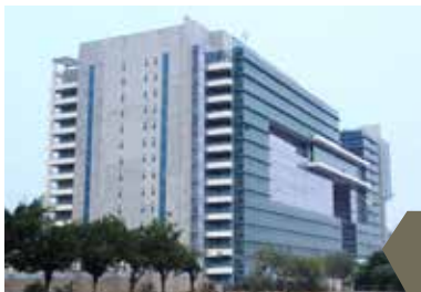
HCL Office, Faridabad Ecosense Exceed - Green vision