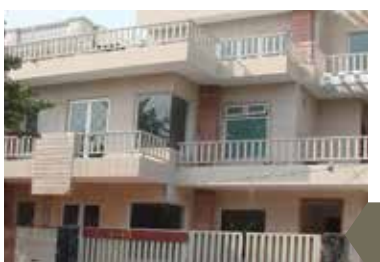
Karan Deep, Delhi AIS VUE