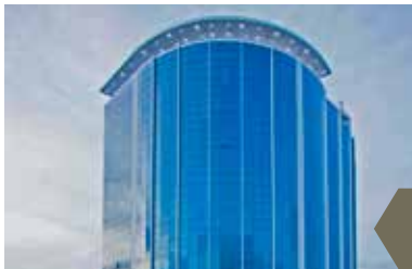
Suratwala, Pune Ecosense Enhance - Cove