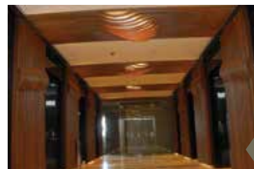
The Capital, Mumbai AIS Décor– Black Pearl