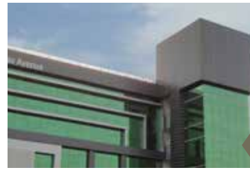
Madhav Avenue, Ahmedabad AIS Opal – Cool Green