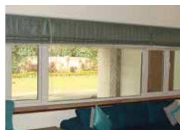
Guest House, Delhi AIS VUE