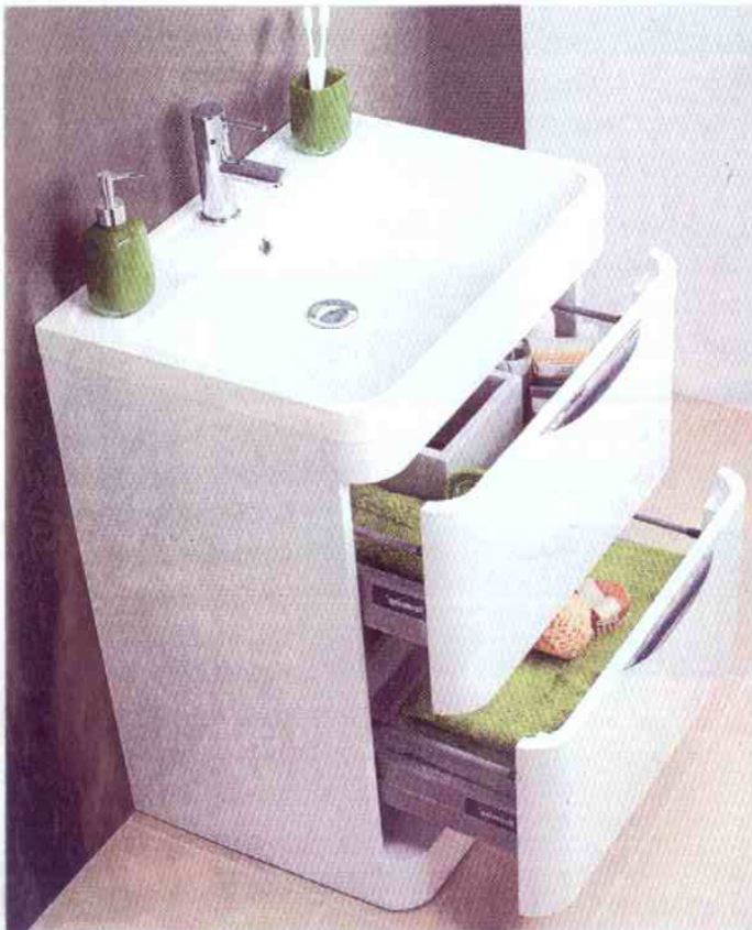
Vanity units with drawers make the bathroom look less cluttered (above); wall-hung vanity is ideal to clear the ground space (right)

Know how to make the most of your space-challenged bathroom through right fittings, colour, textures and light. By SHELLY ANAND