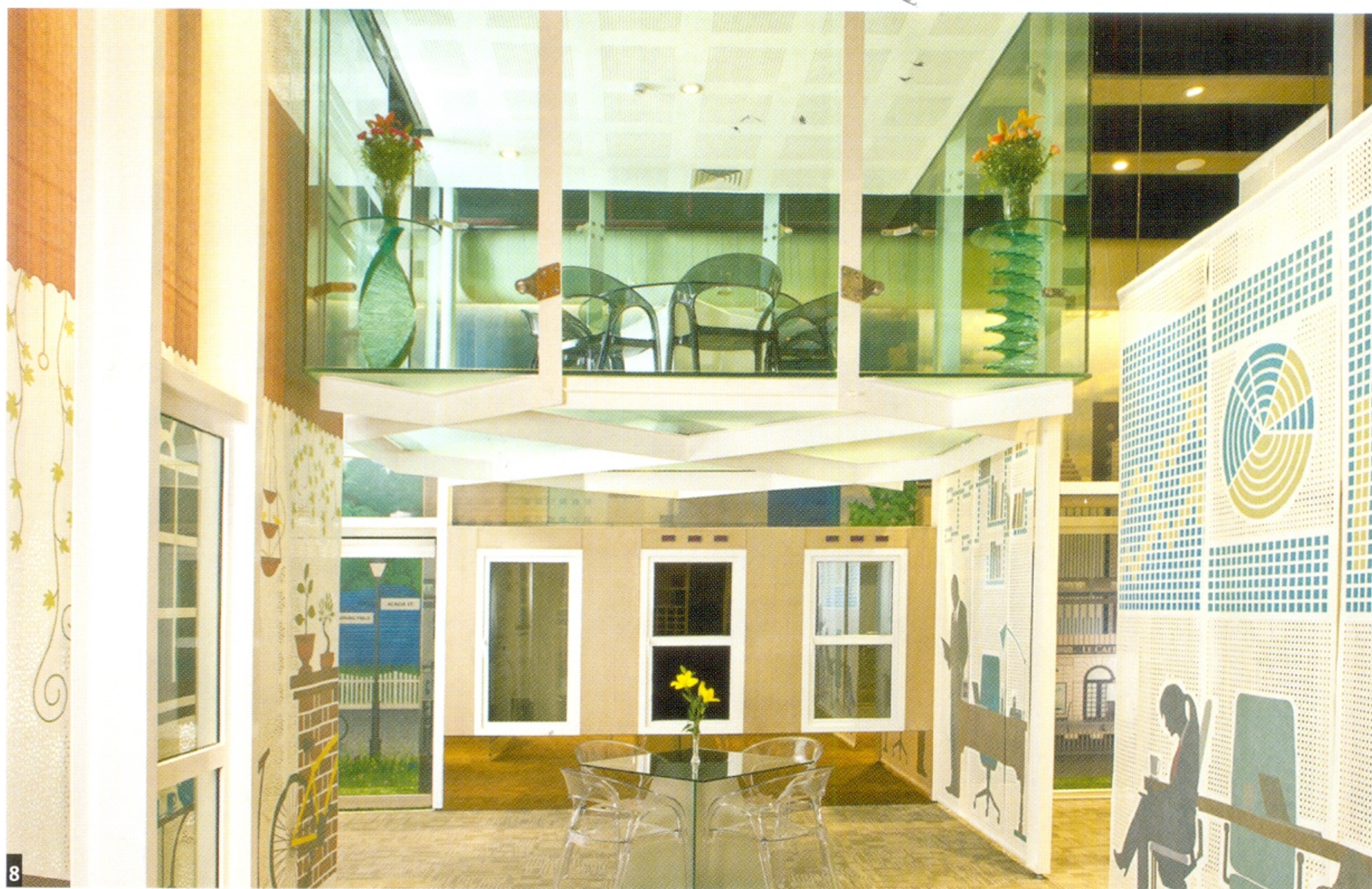
8. AIS Securityplus was used to create the hanging glass conference room at the AIS Glasxperts showroom.